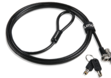
Kensington MicroSaver DS 2.0 Cable Lock from Lenovo